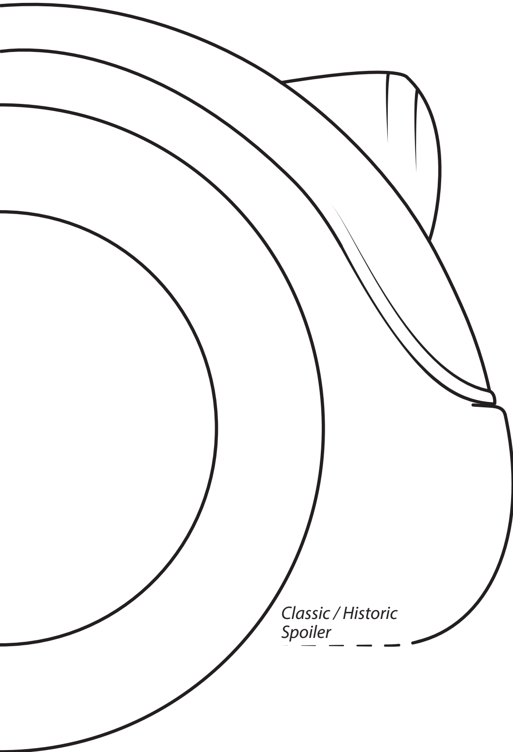
Classic / Historic Spoiler